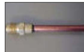
Vax 4 Access Valve